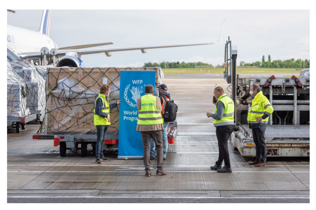
A WFP-contracted Boeing 757 cargo flight being prepared to depart the newly-established Global Humanitarian Response Hub in Liège, Belgium carrying almost 16 metric tons of medical cargo and personal protective equipment such as masks and gloves on behalf of UNICEF and the ICRC destined for Burkina Faso and Ghana.

WHO Strategy Pillar 1: To ensure global and regional coordination of response efforts, including coordinated global supply chain management.