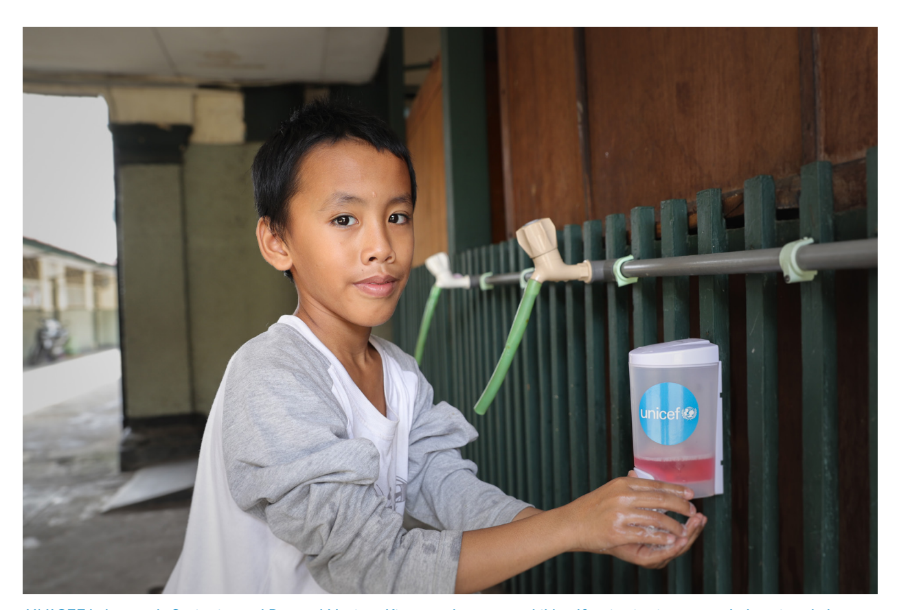
UNICEF helps supply Sanitation and Personal Hygiene Kits to orphanages or child welfare institutions across Indonesia to help protect vulnerable children from COVID-19.

In April, US$10 million was disbursed to UNICEF for its COVID-19 work supporting vulnerable countries with access to evidence-based information; access to WASH and basic IPC measures, and access to care for vulnerable families and children.