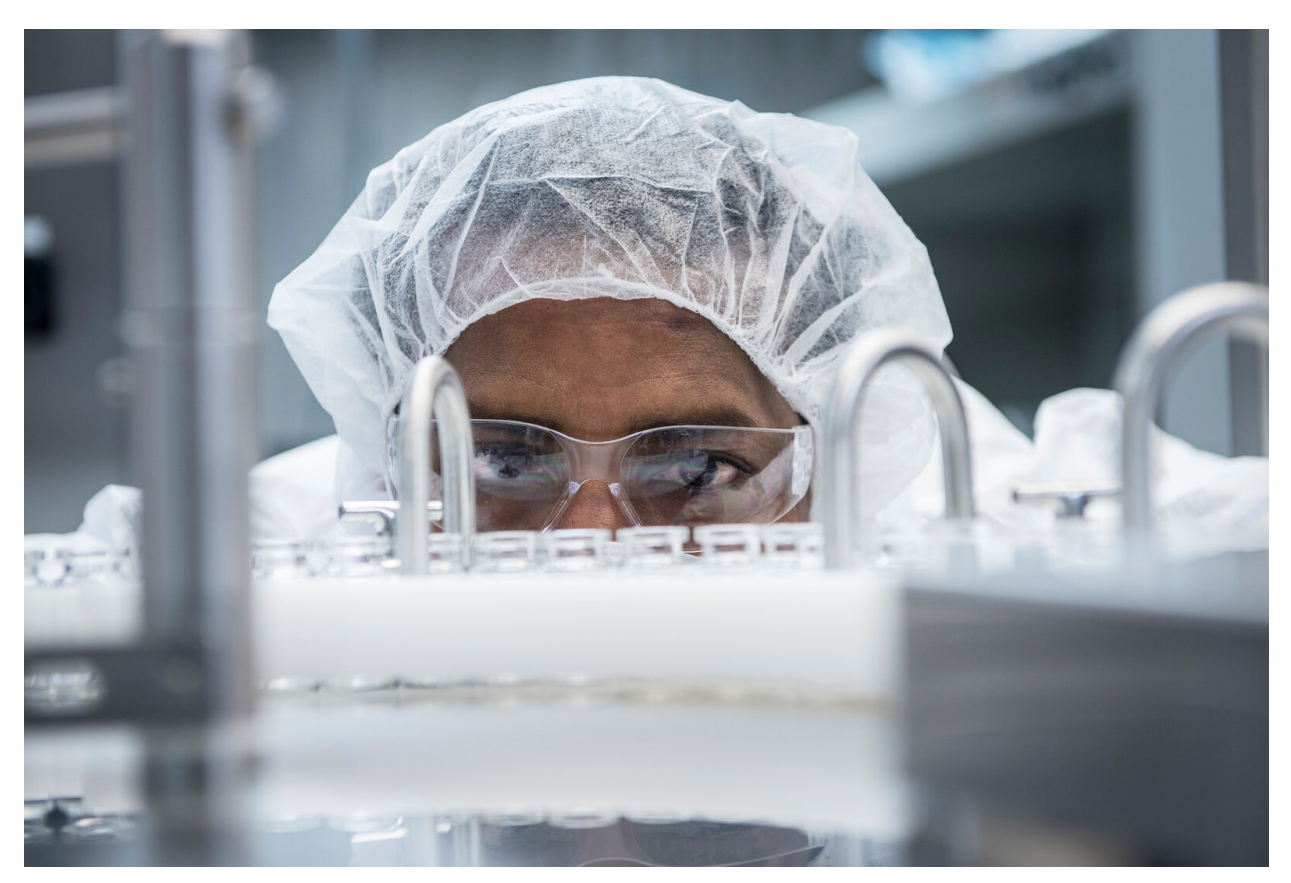
Manufacturing at AstraZeneca

CEPI is continuing to work around the clock with its partners to <u>develop COVID-19 vaccines at pandemic speed</u>. In May, Novavax Inc. became the fourth CEPI-funded vaccine programme to enter Phase 1 clinical trials to test the safety of its vaccine candidate, joining Moderna, Inovio and the University of Oxford.