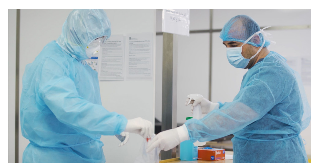
Frontline workers at a health care facility in Lebanon.